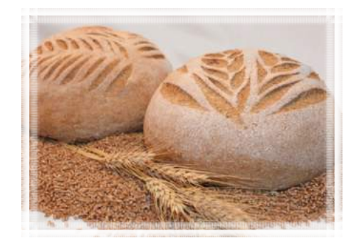
Bread. The way it ought to be.

Let us do the work for you. We cater for small or large groups, meetings and events.